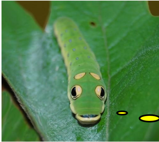
The spicebush swallowtail caterpillar resembles a tiny snake and thereby may gain some protection from predators.

Within the community of plants and animals, sassafras acts as a host for the spicebush swallowtail butterfly. The caterpillars feed on the young leaves. The adult butterfly is black with ivory colored spots along the edges of its wings, and is a common sight throughout the park from spring to early fall.