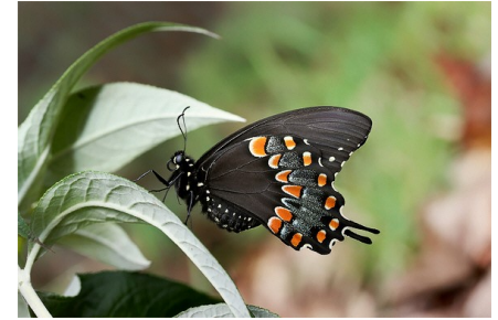
Spicebush Swallowtail Butterfly

I may look scary but I'm not dangerous. This just helps me turn into a beautiful butterfly!