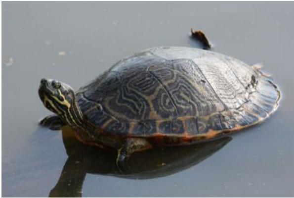
A yellow-bellied slider rests in the sun on a half-sunken log.

A behavioral adaptation of aquatic turtles is to crawl on logs to sun themselves. Turtles are endothermic, or cold-blooded, which means their body temperature changes with their environment. Basking in the sun helps turtles remain active even if the water is cold. Sunlight also helps the turtles create Vitamin D, which is needed for their shells to grow.