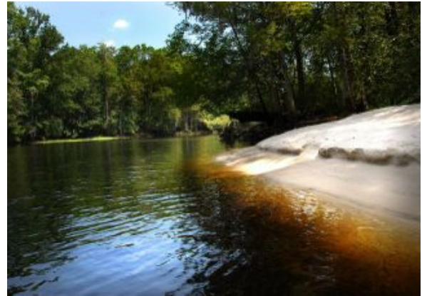
See the unique color of the Lumber River at the Chalk Banks section of the state park.

The Lumber River is a unique blackwater river. The water is not dark because it is dirty. In fact, the Lumber River is very clean. It is dark because so much of the watershed, or land that drains into the river, is a swamp forest. The swamp forest ecosystem is a type of wetland. Scientists describe wetlands by their plants, soils and hydrology. Hydrology is how water moves and most wetlands are covered with water for at least part of the year.