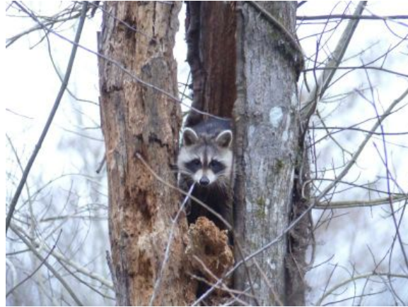
A raccoon peeks out of a hollow cypress tree.

Hollow bald cypress trees in the swamp forest provide habitat for a variety of consumers. Bats and spiders roost in the tree cavities where they can easily feast on thousands of insects of the swamp forest. Wood ducks also nest in hollow trees. A day after hatching, wood duck chicks plunge six feet down from the tree cavity to take their first swim in the river. Raccoons, opossum, lizards and owls also live in hollow trees.