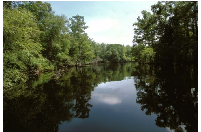
The southeastern United States and the Amazon River Basin in South America are the main places on Earth we find blackwater rivers.