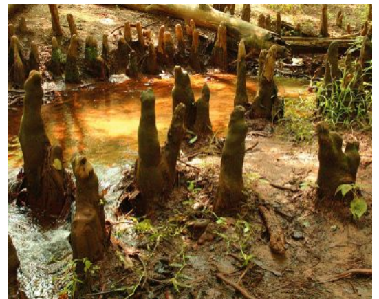
Bald cypress knees stick out of the soil.