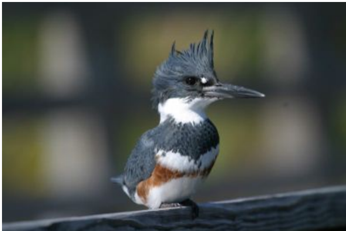
A belted kingfisher sits on a dock overlooking the river.

Many animals along the Lumber River rely on both the forest and the river to survive. Wetlands like the swamp forest tend to be ecosystems with high biodiversity. The great variety of life along the Lumber River makes it especially important to have a state park protecting the river.