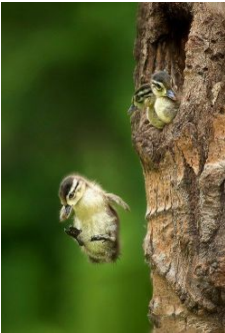
Wood duck chick cannonballs down from a hollow tree.

Hollow bald cypress trees in the swamp forest provide habitat for a variety of consumers. Bats and spiders roost in the tree cavities where they can easily feast on thousands of insects of the swamp forest. Wood ducks also nest in hollow trees. A day after hatching, wood duck chicks plunge six feet down from the tree cavity to take their first swim in the river. Raccoons, opossum, lizards and owls also live in hollow trees.