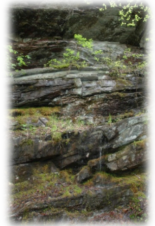
Spray Community on the Cliff

A spray cliff ecosystem can occur in combination with waterfalls, and along streams in areas with escarpments and resistant rock. Spray cliff ecosystems are areas with long-term wetness caused by the waterfall spray. The exposure to large amounts of water also limits temperature extremes and keeps humidity high. Many waterfalls also have an overhanging ledge, where light levels are low. These areas are generally steep, rocky and have limited soil. Most spray cliff ecosystems are in narrow gorges, where the land profile shades them from drying sun and protects them from wind. At Hanging Rock, unique plant species of lichen, moss, liverwort and ferns thrive on the cliffs in this special micro-climate .