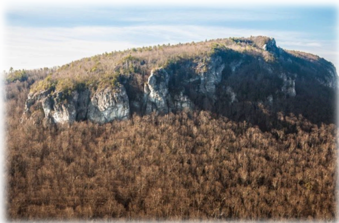
Hanging Rock escarpment

above the surrounding area. A monadnock is the leftover of a larger mountain range and is protected by a hard cap of rock. As a result, a monadnock's elevation is much greater as compared to the other landforms nearby. At Hanging Rock, the monadnock is made of quartzite, which is a hard rock that resists weathering and erosion .