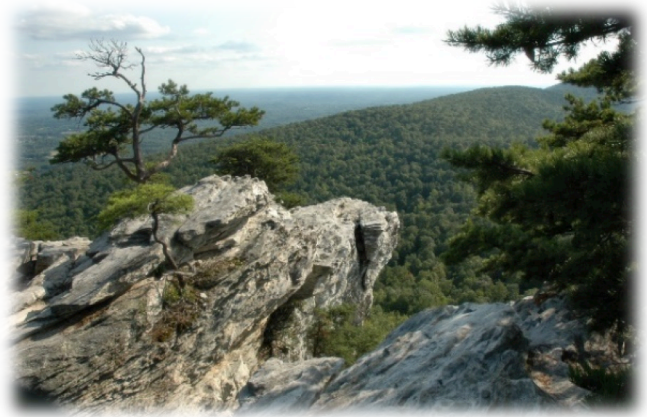
View out over Hanging Rock

Named for the Saura Indians who were early inhabitants of the region, the Sauratown Mountains are the remnants of a once-mighty range of peaks. Over many millions of years, wind, water, and other forces wore down the soaring peaks. What remains of these ancient mountains is the erosion resistant quartzite monadnocks . The word monadnock means isolated mountain. It is used to describe a singular peak or knob of rock that stands dramatically