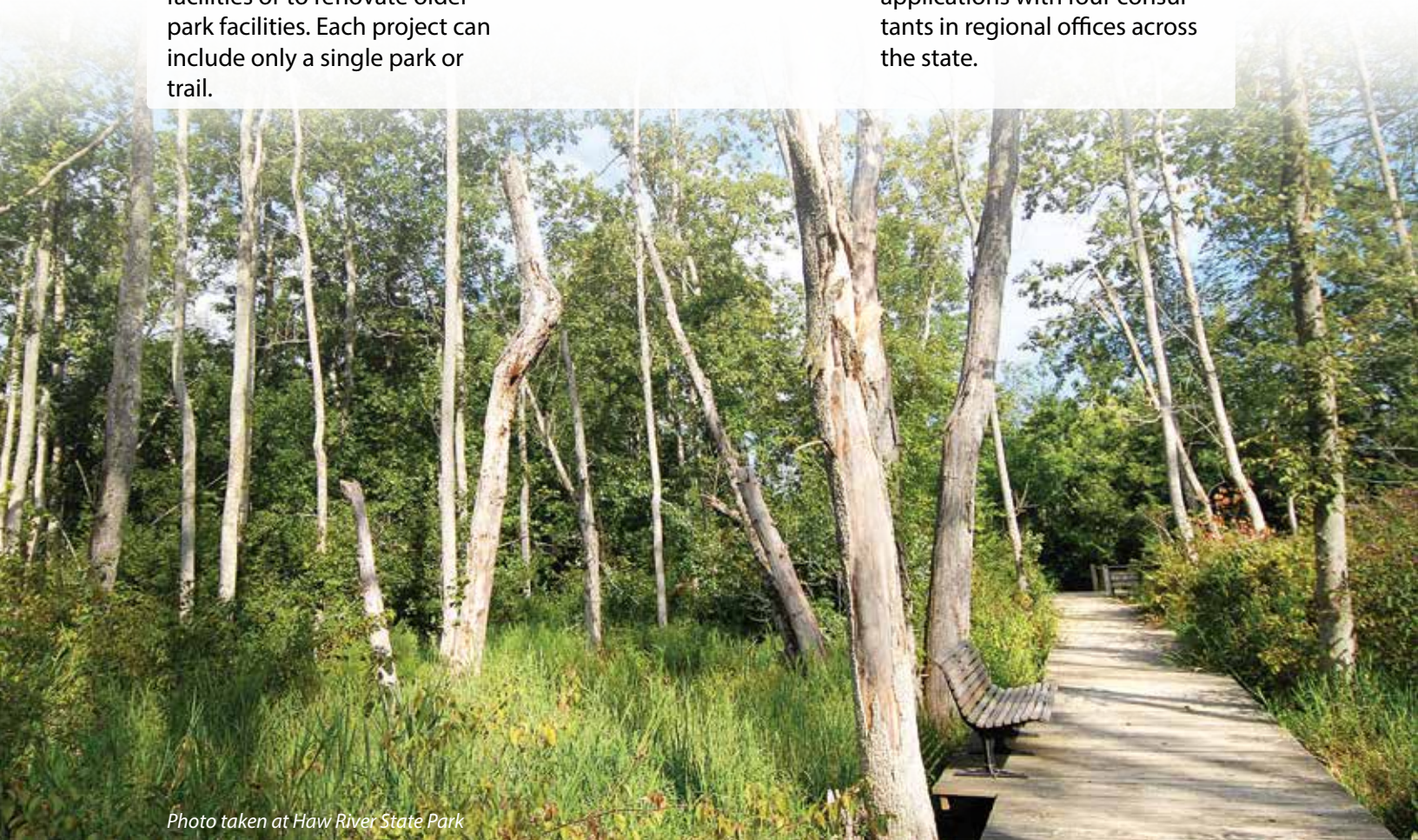
Photo taken at Haw River State Park

The DPR provides assistance to local governments in several ways. In September, the PARTF staff conducts a workshop where local governments can learn about the program and how to complete an application. The workshop is presented at video conference sites across the state. The DPR has a contract with North Carolina State University to provide technical assistance to local governments through the Recreation Resources Service (RRS). RRS assists local governments in planning PARTF projects and preparing grant applications with four consultants in regional offices across the state.