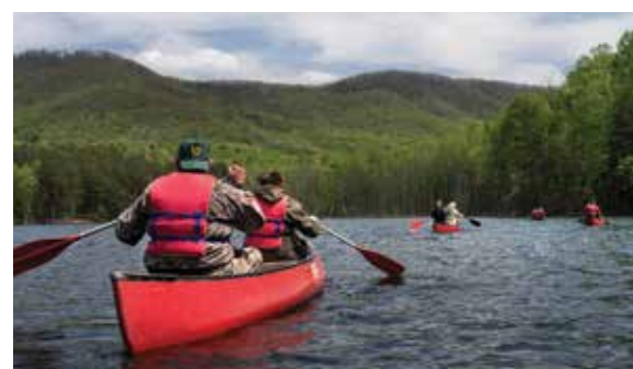
Photos taken at (from top): Chimney Rock, Eno River, Hammocks Beach, Mount Jefferson and South Mountains.