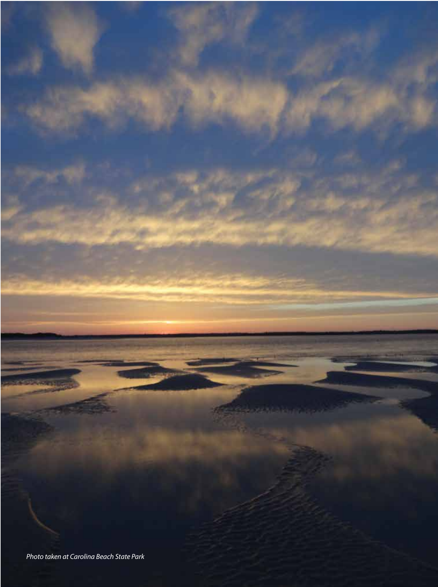
Photo taken at Carolina Beach State Park