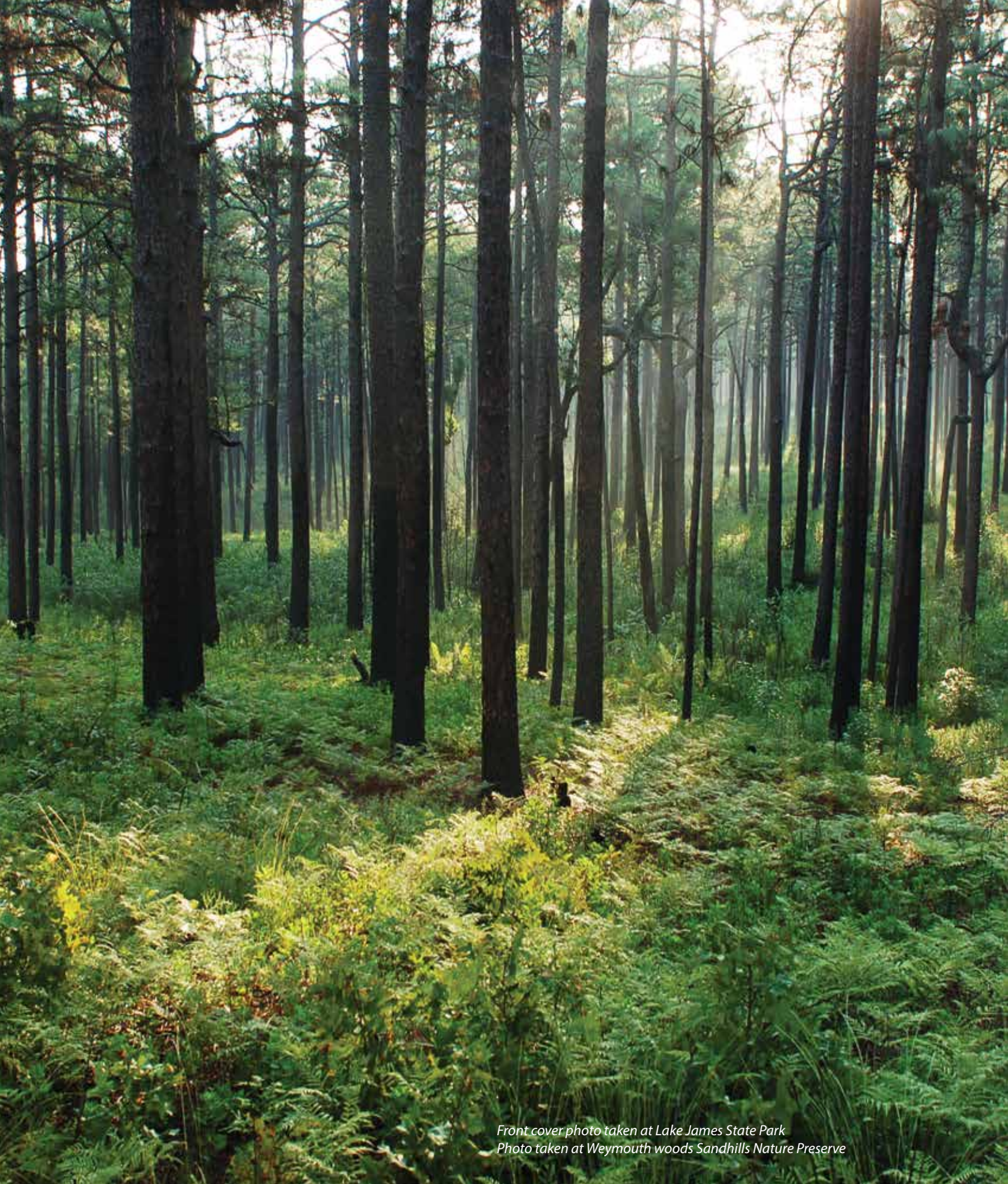
Front cover photo taken at Lake James State Park Photo taken at Weymouth woods Sandhills Nature Preserve