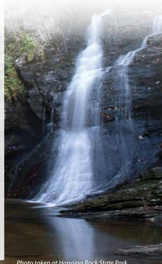
Photo taken at Hanging Rock State Park