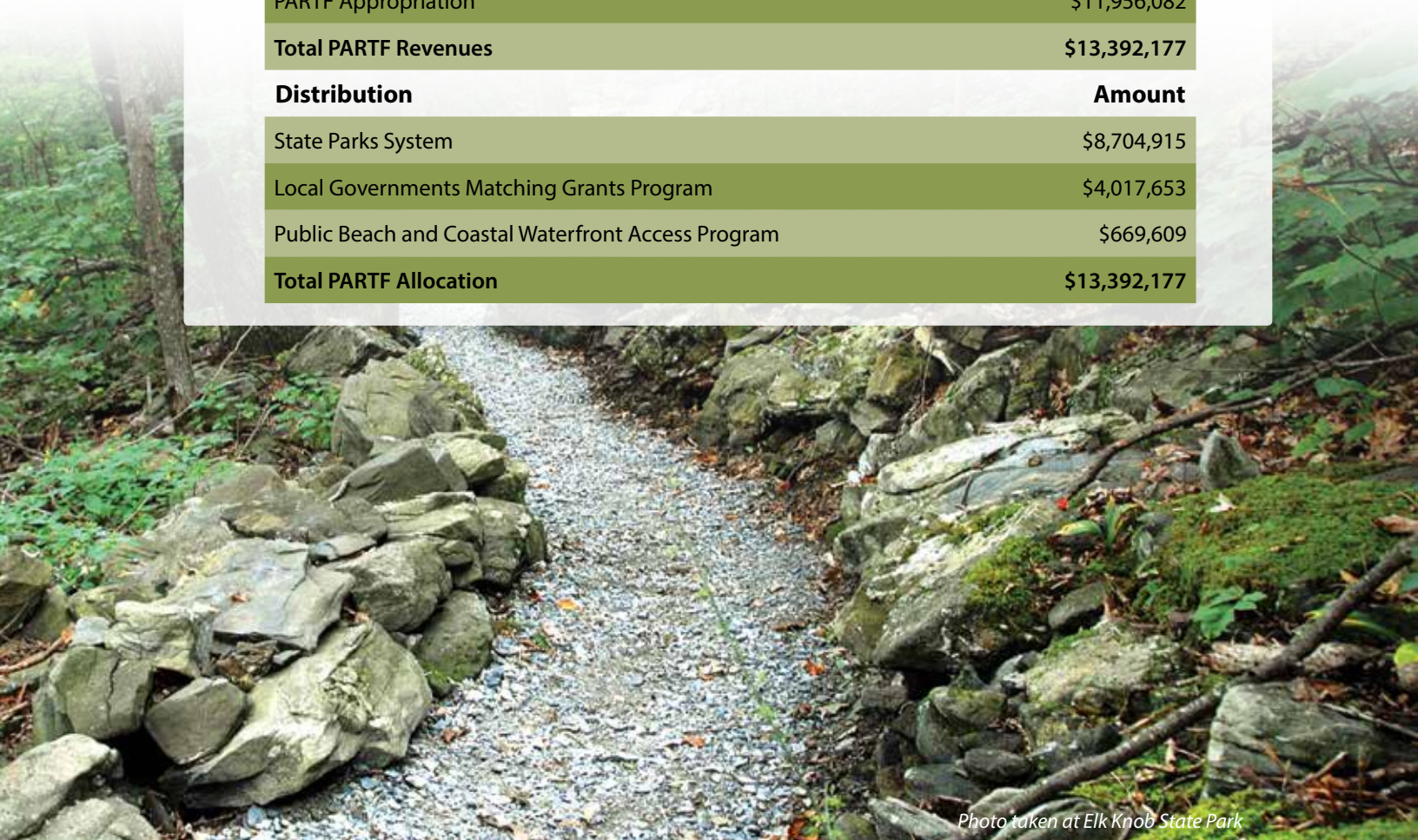
Photo taken at Elk Knob State Park